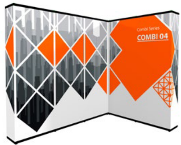
Example of a P33 panel and P32 panel right angle arrangement